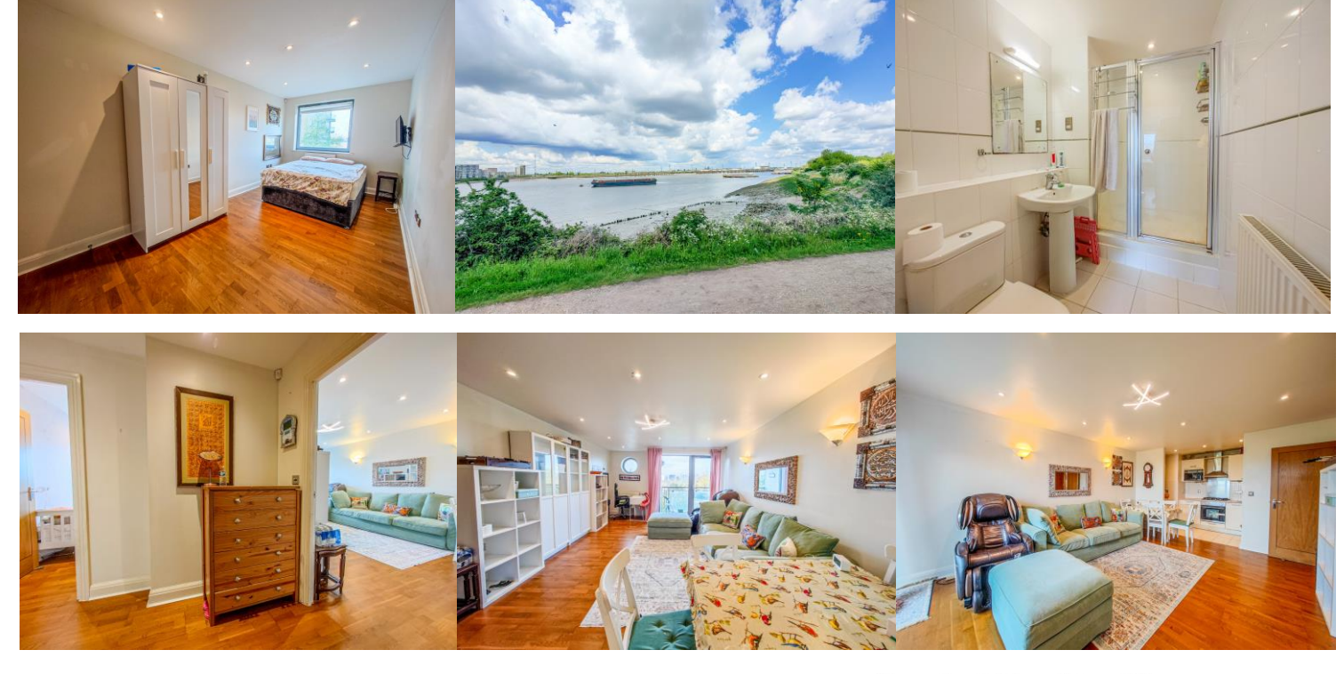
Approximate Gross Internal Area 67 Sq M/720 Sq Ft

24 Plumstead Common Road, SE183TN 020 8316 6616 sales@hi-residential.com lettings@hi-residential.com www.hi-residential.com